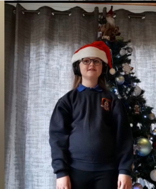
Children and leaders have been sending us videos of themselves singing in front of their Christmas tree to put together into one big christmas carol!